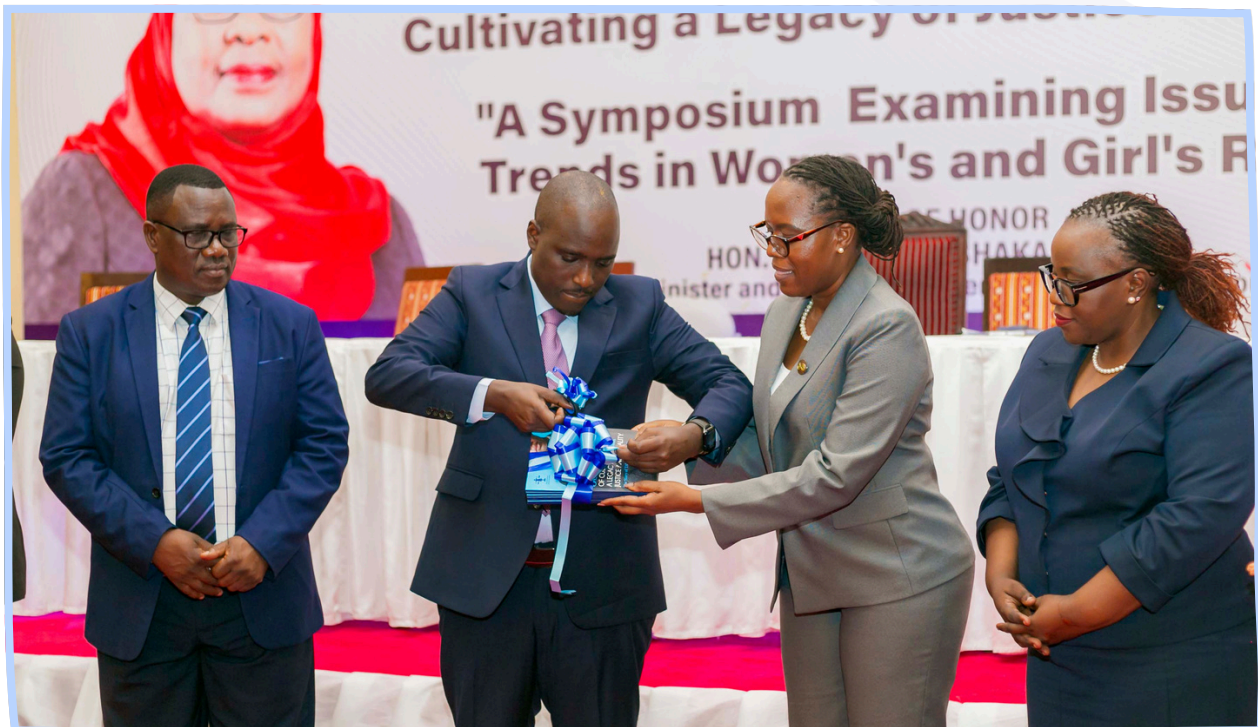
Hon. Dr. Dotto Biteko launching the TAWLA Story Book

Unveiled by Hon. Dr. Dotto Biteko, the publication honors the organization's legacy while serving as a guiding light for the future. It stands as both a tribute to the courageous journey of those who came before and an inspiration for the continued fight for justice and gender equality in Tanzania.