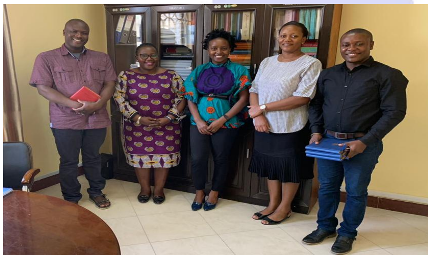
TAWLA Secretariat members in a group picture with representatives from EQUALITY NOW

TAWLA keeps its partners close as it hosted EQUALITY NOW to discuss interventions around gender based violence and girl child's right to education in Tanzania.