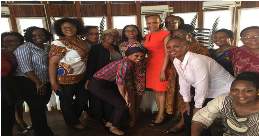
A group picture of some of the TAWLA members who attended the motivational talk.

The overall objective of the session was to share experience and engage TAWLA members in the discussion on the issue of Gender Pay Gap in the employment sector and to also guide them to strategize and come up with strategies on how to advance gender equality in Employment sector.