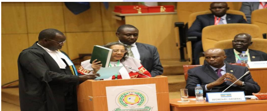
Hon. Lady Justice Sauda Mjasiri (Rtd) being sworn in as a Judge to the Appellate Division of the East African Court of Justice

The East African Community also appointed Hon. Lady Justice Sauda Mjasiri (Rtd) as a Judge to the Appellate Division of the East African Court of Justice. This shows the rich resource of members with the knowledge, expertise and experience that TAWLA has.