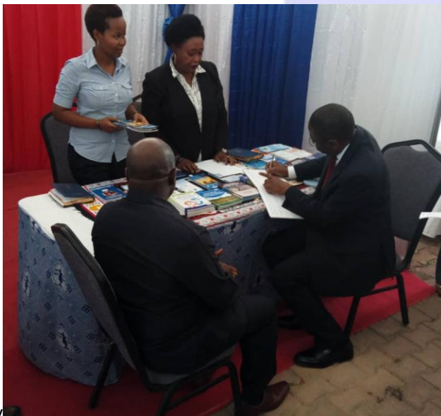
The Hon. Chief Justice, Prof. Ibrahim Hamis Juma signing TAWLA visitors book when he visited TAWLA's booth during the Law Week in Dodoma

The LAW WEEK comes as an official opening of the Judiciary activities each year with its peak being the National Law Day. All regional offices participated on this activity by providing legal aid services to the members of public, specifically women and distributing TAWLA's publications. The LAW WEEK took place in early February, 2019.