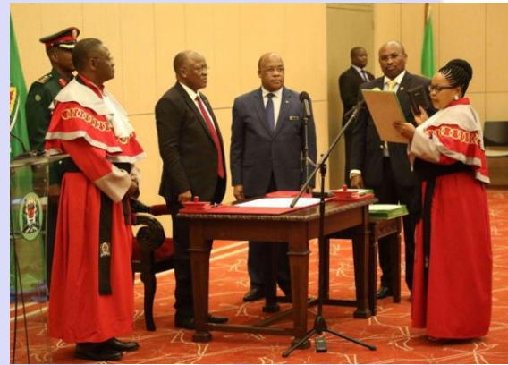
Hon. Lady Justice Rehema Kerefu as she was being sworn in by the President of the United Republic of Tanzania

The East African Community also appointed Hon. Lady Justice Sauda Mjasiri (Rtd) as a Judge to the Appellate Division of the East African Court of Justice. This shows the rich resource of members with the knowledge, expertise and experience that TAWLA has.