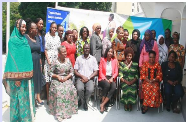
Chief Guest in a group photo with the participants of the forum