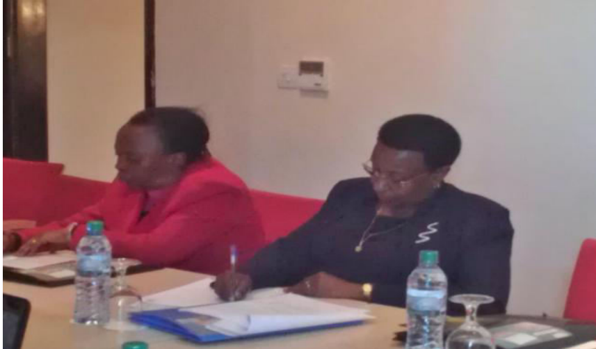
Justice Eusebia Munuo, and Judge Patricia Fikirini, during the round-table discussion