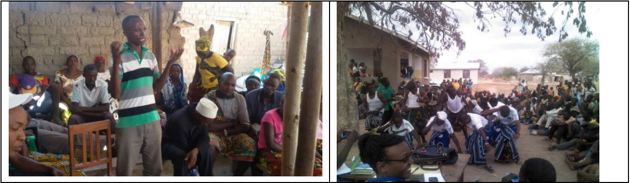
Community conversations session and engagement of sanaa groups to pass human rights messages to the community members.