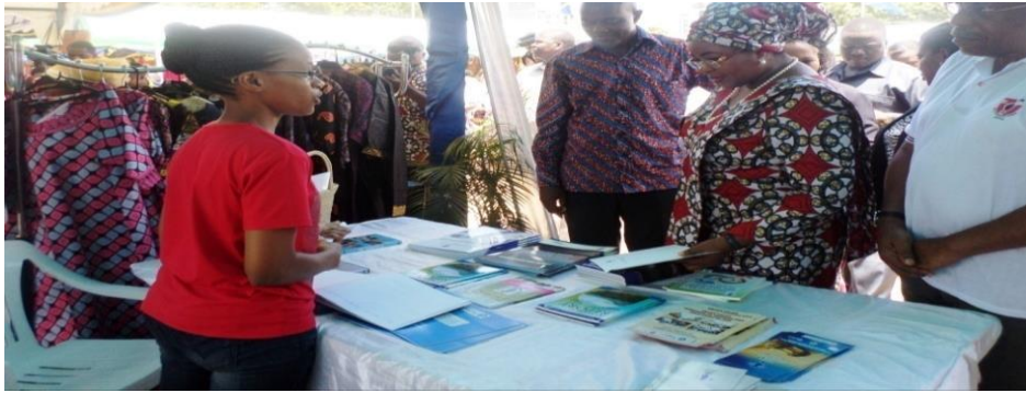
The first lady Hon. Salma Kikwete viewing TAWLA's publications during Exhibition at Mnazi mmoja

different stakeholders on issues that affect women in Tanzania.