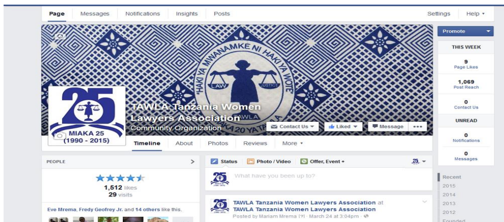
TAWLA facebook page