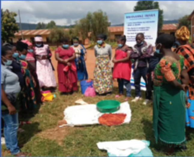
Soap making in Ludewa district