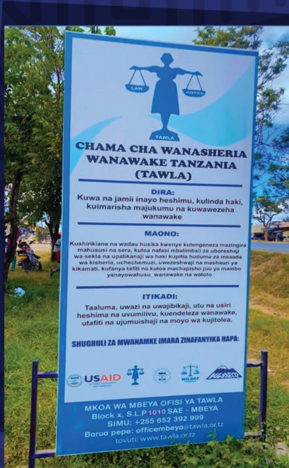
An office signage for Mwanamke Imara Legal Aid Clinic in Mbeya-Sae.