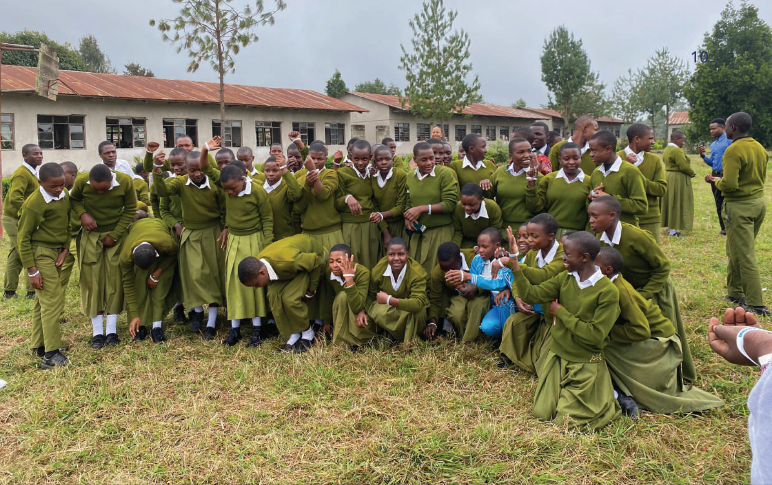
A group picture of members of the Mwanamke Imara Shule Salama Club at Kiwira Secondary School.