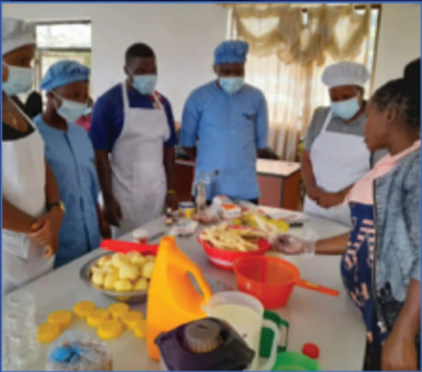
Snacks making in Rungwe district