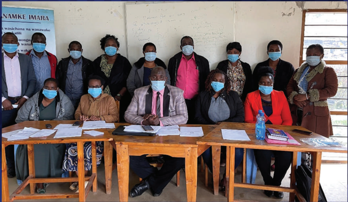
A group photo of members of VAWC Committee at Makete District during one of their quarterly meetings.