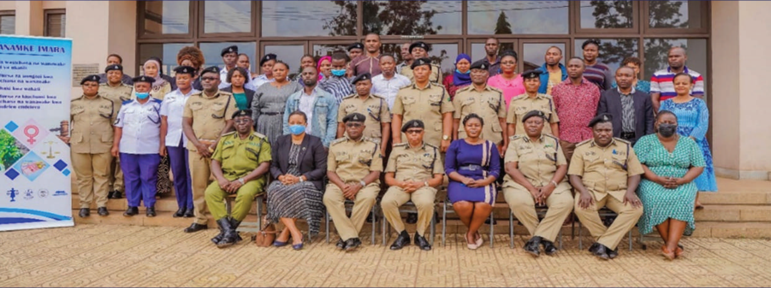
Members of Police Gender and Children Desks and Mwanamke Imara Implementing Partners during the Training that took place at Kilimanjaro