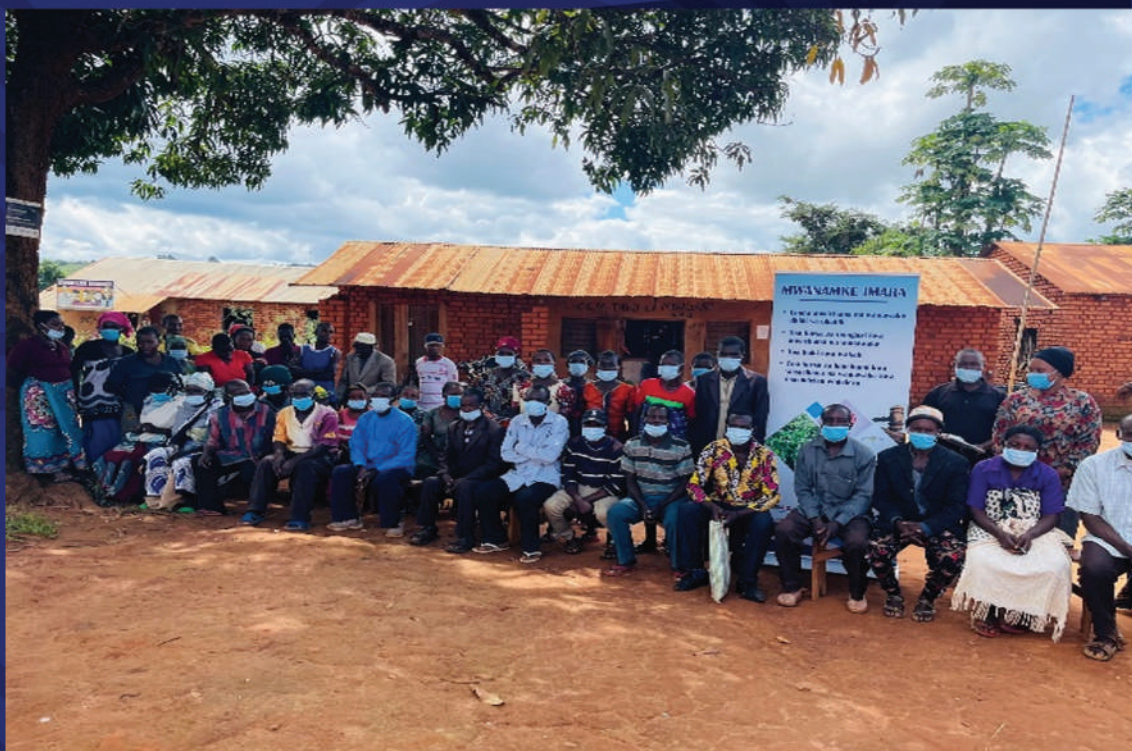
Community members during community awareness session on gender and leadership role to change community perception on women and youth leaders at Mbugani village in Ludewa District